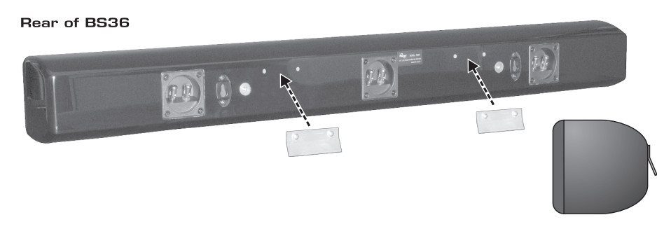
Step 1: Attach small bracket to left and right pre-drilled pilot hole positions as shown using supplied screws.

Optional wall mounting of BS36 LCR speaker bar using bracket mounting system (available separately)